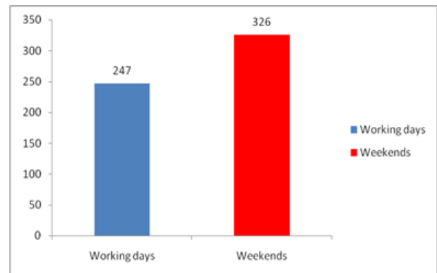
Figure 2: Distribution of RTA cases based on day of accident.